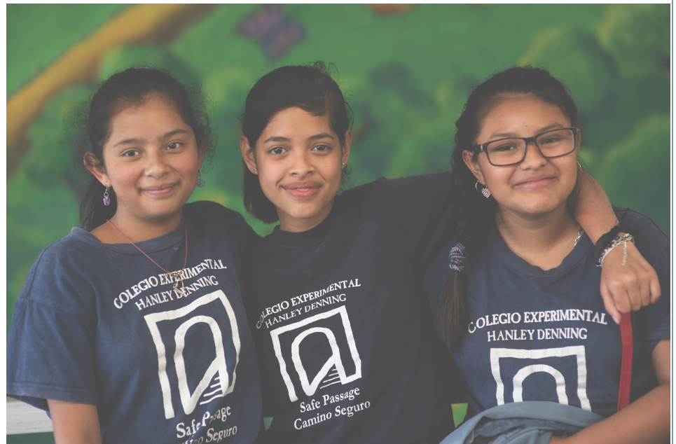
Safe Passage Students Today