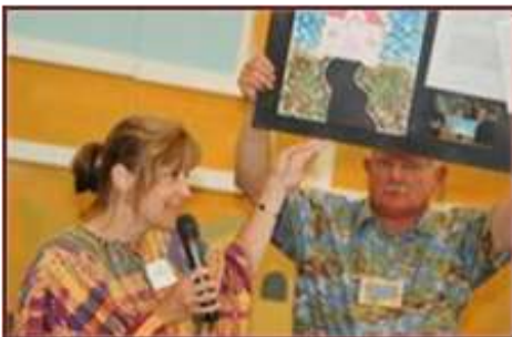
Children's artwork is auctioned off at the 2nd annual Fiesta held in Traverse City, Michigan last summer.

If you are interested in joining a Safe Passage Friends Group or would like to begin one in your area, please contact Safe Passage at outreach@safepassage.org .