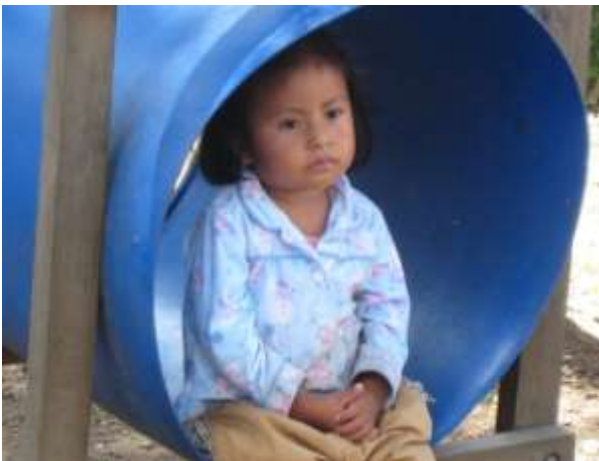
A preschool student at the Fran Walter Doonan Early Childhood Education Center finds a quiet moment in the new playground.